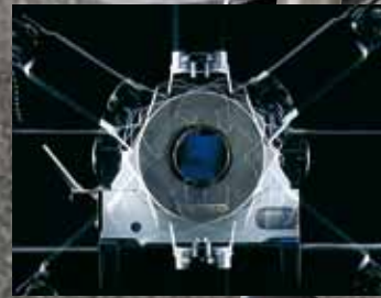
Planetary Cutting Technology