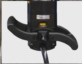
New motor with extended speed range