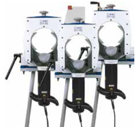
RA 8, RA 8 AVM, RA 8 MVM