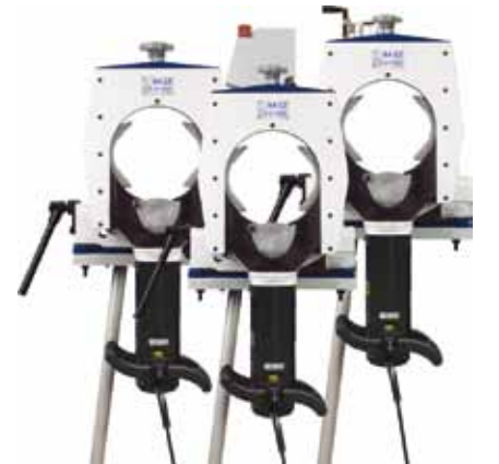
RA 12, RA 12 AVM, RA 12 MVM