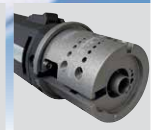
ESG MAX: Laterally adjustable grinding head with 72 holes