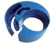
Adapter for extraction device ESG MAX