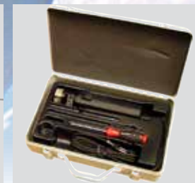
Durable storage and shipping case