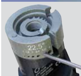
Grinding electrodes: 4 different angles and 6 different electrode sizes

One machine – complete electrode preparation!