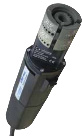
ESG Plus 2