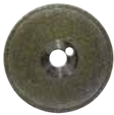
Diamond grinding wheels