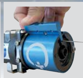
Cutting electrodes (ESG MAX)