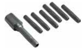
Electrode holder with 6 collets (for ESG MAX)

The electrode holder for the ESG Plus or ESG Plus 2 is supplied including 1 flexible collet.